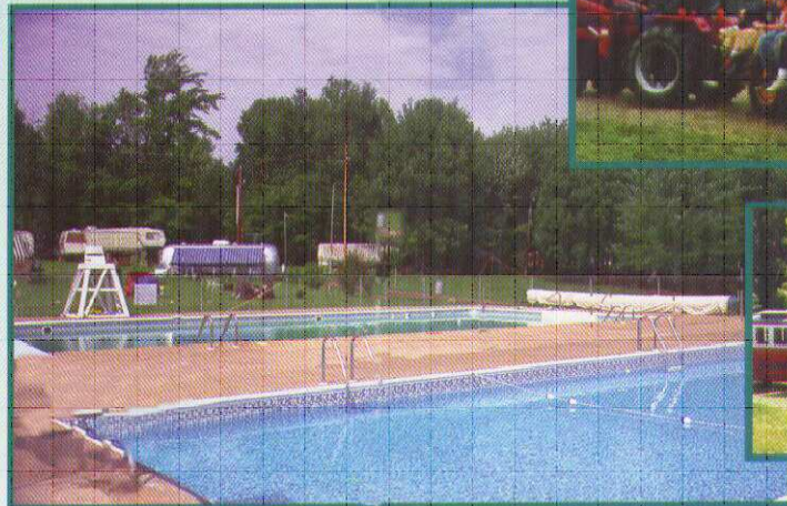
Two swimming pools